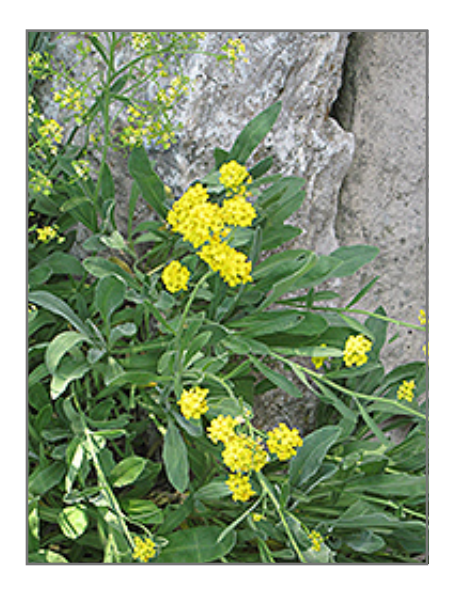
Basket Of Gold Alyssum flowers

Basket Of Gold Alyssum is recommended for the following landscape applications;