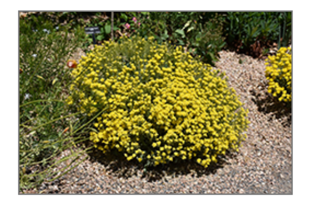
Basket Of Gold Alyssum in bloom

This plant will require occasional maintenance and upkeep, and is best cleaned up in early spring before it resumes active growth for the season. It is a good choice for attracting bees and butterflies to your yard, but is not particularly attractive to deer who tend to leave it alone in favor of tastier treats. It has no significant negative characteristics.