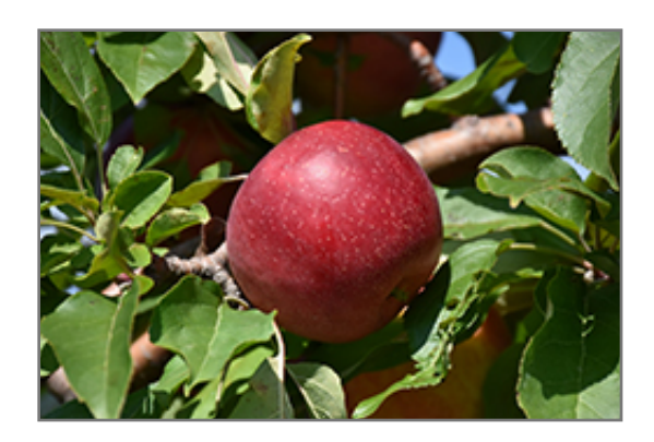
Haralred Apple fruit

Haralred Apple features showy clusters of lightly-scented white flowers with shell pink overtones along the branches in mid spring, which emerge from distinctive pink flower buds. It has forest green deciduous foliage. The pointy leaves turn yellow in fall. The fruits are showy dark red apples carried in abundance in mid fall. The fruit can be messy if allowed to drop on the lawn or walkways, and may require occasional clean-up.