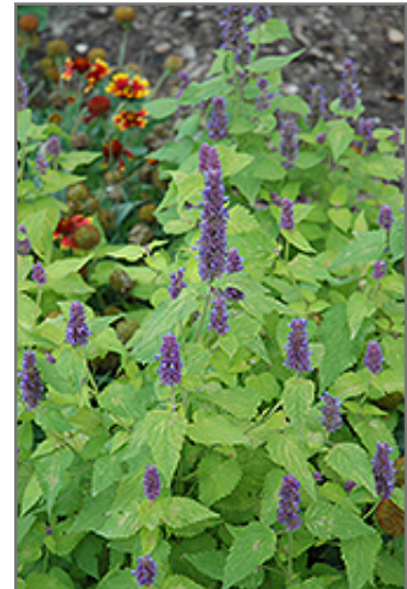
Golden Jubilee Anise Hyssop flowers

Golden Jubilee Anise Hyssop is recommended for the following landscape applications;