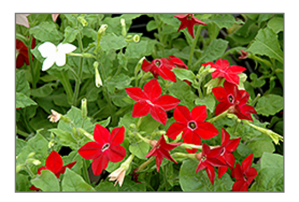
Saratoga Mix Flowering Tobacco flowers

gardens, and makes a great accent plant in containers