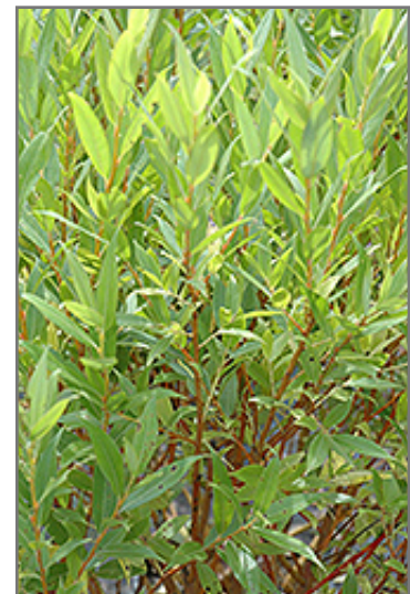
Flame Willow foliage