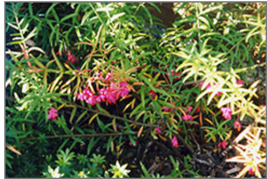
Dwarf Turkestan Burning Bush flowers

This shrub performs well in both full sun and full shade. It is very adaptable to both dry and moist locations, and should do just fine under typical garden conditions. It is not particular as to soil type or pH. It is highly tolerant of urban pollution and will even thrive in inner city environments. This is a selected variety of a species not originally from North America.