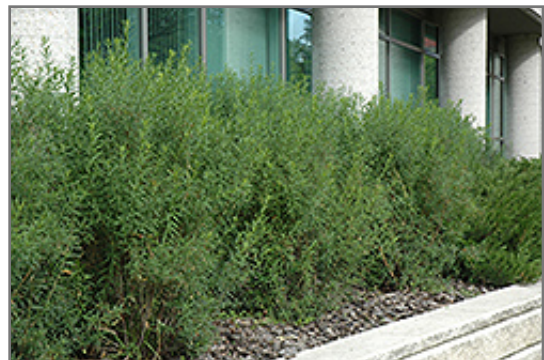
Dwarf Turkestan Burning Bush