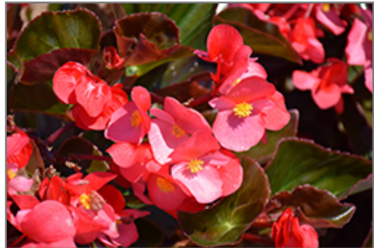
Whopper Rose Bronze Leaf Begonia flowers

Whopper Rose Bronze Leaf Begonia is an herbaceous annual with an upright spreading habit of growth. Its medium texture blends into the garden, but can always be balanced by a couple of finer or coarser plants for an effective composition.