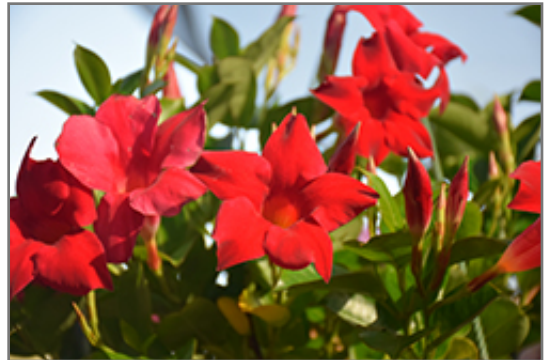
Sun Parasol Crimson Mandevilla flowers

This plant is native to the tropics and prefers growing in moist environments with evenly warm conditions all year round. In our climate, it is usually grown as an outdoor annual in the garden or in a container. If you want it to survive the winter, it can be brought in to the house and provided with special care, and then returned to the garden the following season. In its preferred tropical habitat, it can grow to be around 10 feet tall at maturity, with a spread of 24 inches. However, when grown as an annual or when overwintered indoors, it can be expected to perform differently, and its exact height and spread will depend on many factors; you may wish to consult with our experts as to how it might perform in your specific application and growing conditions.