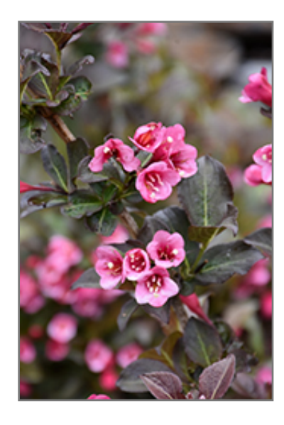
Tango Weigela flowers

This shrub will require occasional maintenance and upkeep, and should only be pruned after flowering to avoid removing any of the current season's flowers. It is a good choice for attracting hummingbirds to your yard. It has no significant negative characteristics.