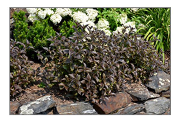
Tango Weigela

Tango Weigela will grow to be about 24 inches tall at maturity, with a spread of 3 feet. It tends to fill out right to the ground and therefore doesn't necessarily require facer plants in front. It grows at a medium rate, and under ideal conditions can be expected to live for approximately 30 years.