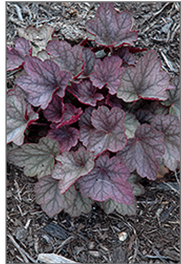
Carnival Rose Granita Coral Bells foliage

Carnival Rose Granita Coral Bells is recommended for the following landscape applications;