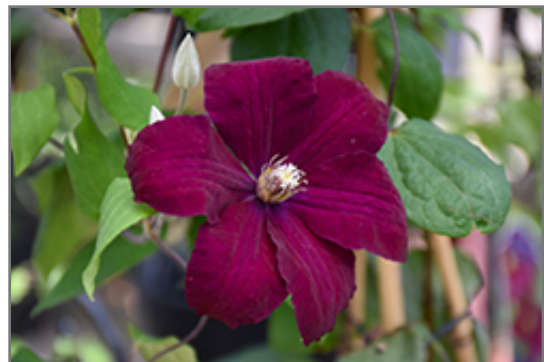
Rouge Cardinal Clematis flowers