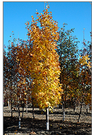
Lord Selkirk Sugar Maple in fall