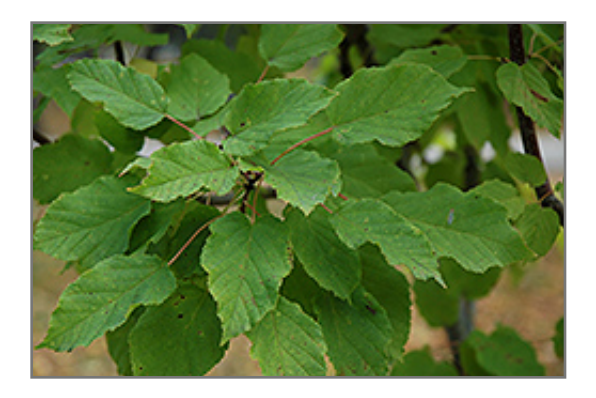
Pattern Perfect Tatarian Maple foliage

Pattern Perfect Tatarian Maple is recommended for the following landscape applications;