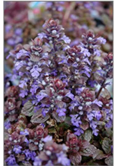
Bronze Beauty Bugleweed flowers