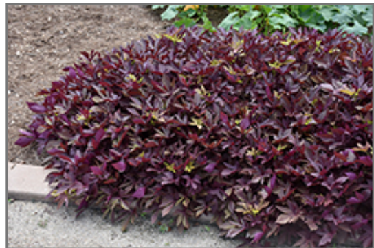
SolarPower Red Sweet Potato Vine