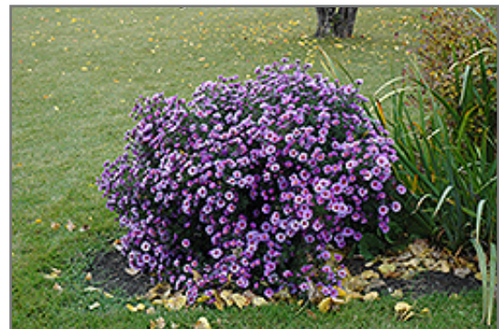
Purple Dome Aster in bloom