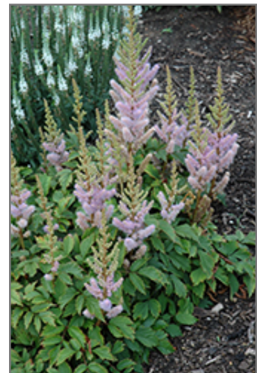
Dwarf Chinese Astilbe in bloom