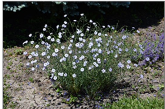
Blue Sapphire Perennial Flax in bloom