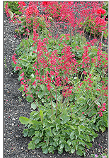
Brandon Pink Coral Bells in bloom

Brandon Pink Coral Bells is recommended for the following landscape applications;