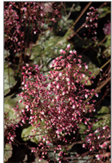
Frosted Violet Coral Bells flowers