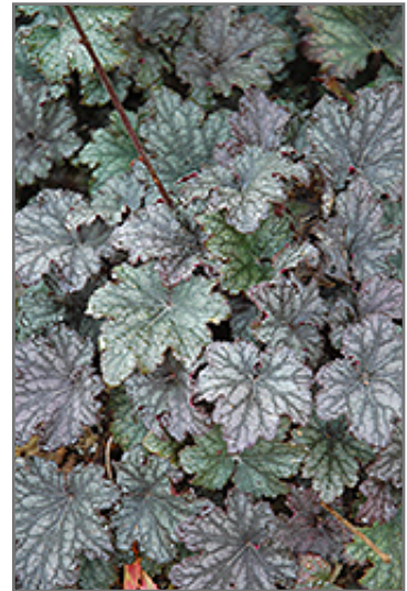
Frosted Violet Coral Bells foliage

Frosted Violet Coral Bells is a dense herbaceous evergreen perennial with tall flower stalks held atop a low mound of foliage. Its relatively fine texture sets it apart from other garden plants with less refined foliage.