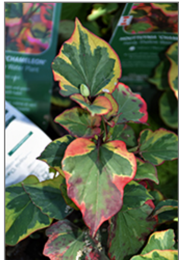
Variegated Chameleon Plant foliage