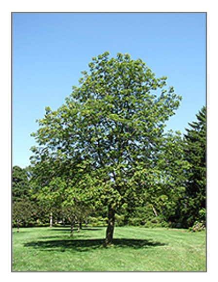
Ohio Buckeye