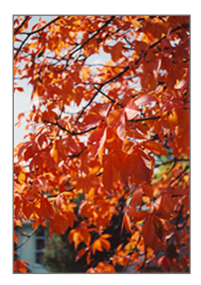
Ohio Buckeye in fall

This tree does best in full sun to partial shade. It prefers to grow in average to moist conditions, and shouldn't be allowed to dry out. It is not particular as to soil type or pH. It is highly tolerant of urban pollution and will even thrive in inner city environments. This species is native to parts of North America.