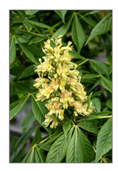
Ohio Buckeye flowers