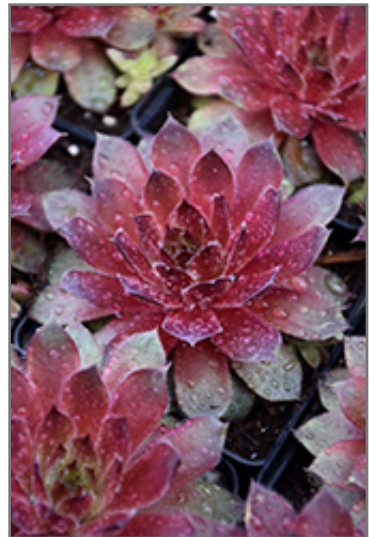
More Honey Hens And Chicks