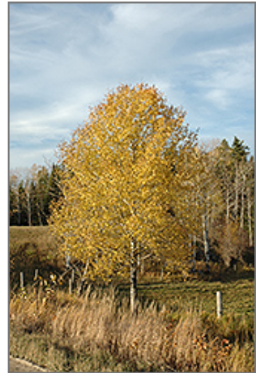
Trembling Aspen in fall

* This is a 'special order' plant - contact store for details