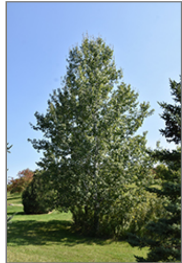
Trembling Aspen