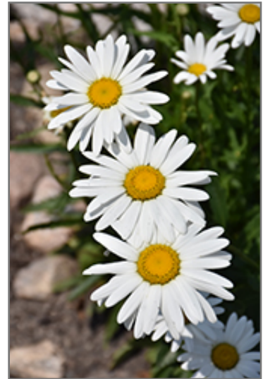
Silver Princess Shasta Daisy flowers