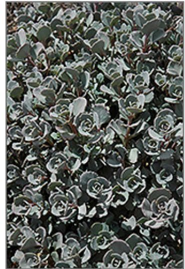
Lidakense Stonecrop foliage

Lidakense Stonecrop is recommended for the following landscape applications;