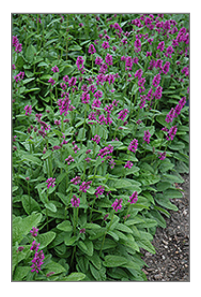
Hummelo Betony in bloom

Hummelo Betony is a dense herbaceous evergreen perennial with tall flower stalks held atop a low mound of foliage. Its medium texture blends into the garden, but can always be balanced by a couple of finer or coarser plants for an effective composition.