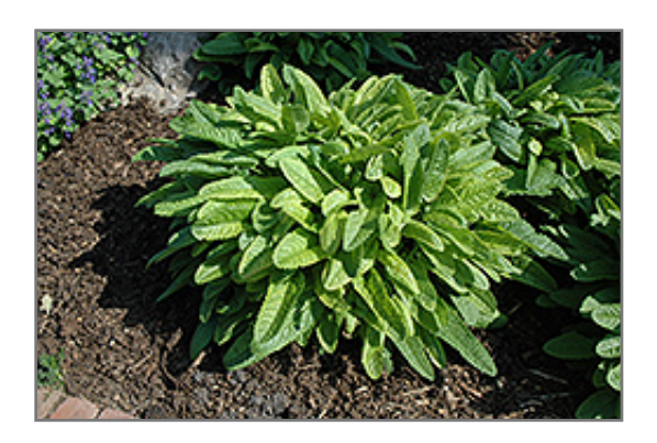
Hummelo Betony

This plant will require occasional maintenance and upkeep, and is best cleaned up in early spring before it resumes active growth for the season. It is a good choice for attracting bees to your yard, but is not particularly attractive to deer who tend to leave it alone in favor of tastier treats. Gardeners should be aware of the following characteristic(s) that may warrant special consideration;