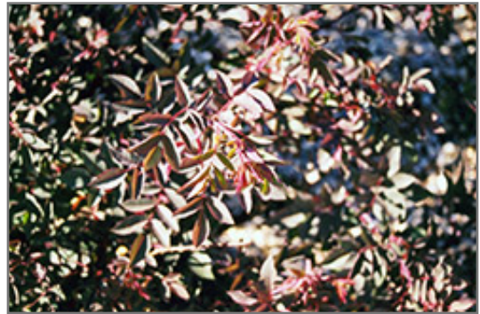
Red Leaf Rose foliage

This shrub should only be grown in full sunlight. It does best in average to evenly moist conditions, but will not tolerate standing water. It is not particular as to soil type or pH. It is highly tolerant of urban pollution and will even thrive in inner city environments. This species is not originally from North America.