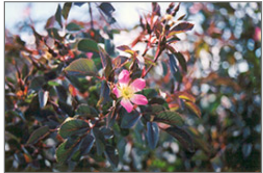
Red Leaf Rose flowers

Red Leaf Rose is a multi-stemmed deciduous shrub with a more or less rounded form. Its average texture blends into the landscape, but can be balanced by one or two finer or coarser trees or shrubs for an effective composition.