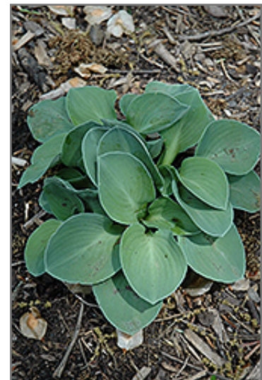
Blue Mouse Ears Hosta