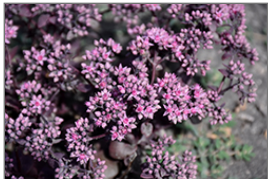
Red Carpet Stonecrop flowers