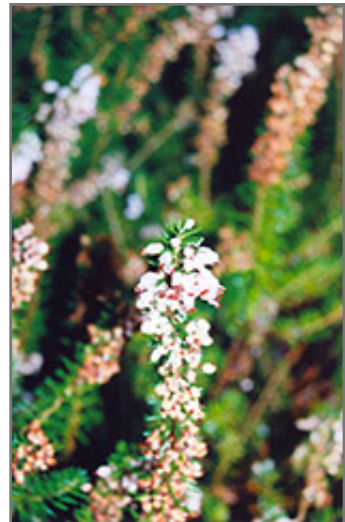
Scotch Heather flowers