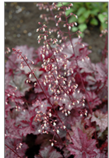
Amethyst Mist Coral Bells flowers