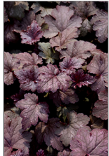
Amethyst Mist Coral Bells foliage

This is a relatively low maintenance plant, and should be cut back in late fall in preparation for winter. It is a good choice for attracting hummingbirds to your yard. It has no significant negative characteristics.