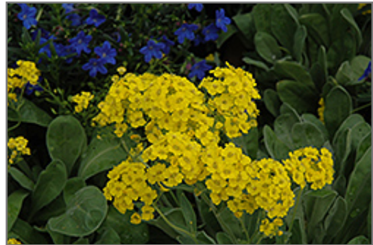
Basket Of Gold Alyssum flowers

Basket Of Gold Alyssum is recommended for the following landscape applications;