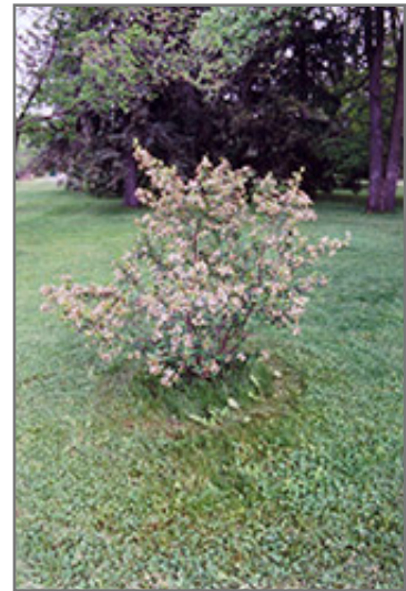
Black Chokeberry in bloom