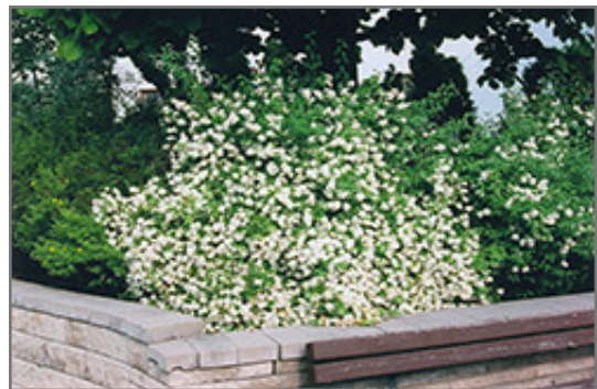
Galahad Mockorange in bloom