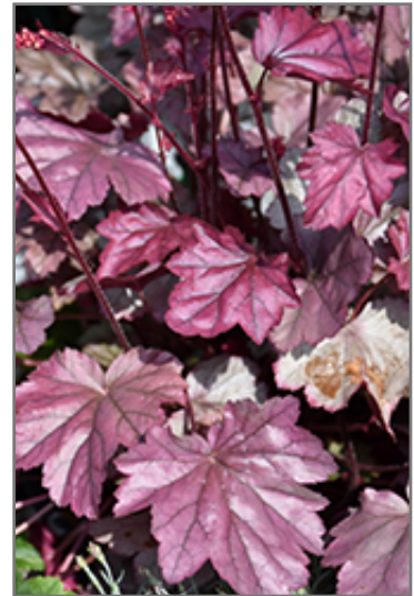
Stainless Steel Coral Bells foliage

Stainless Steel Coral Bells is recommended for the following landscape applications;