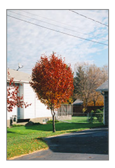
Mountain Frost Pear in fall