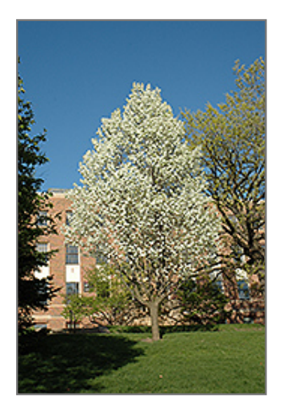
Mountain Frost Pear in bloom

This is a high maintenance tree that will require regular care and upkeep, and is best pruned in late winter once the threat of extreme cold has passed. Gardeners should be aware of the following characteristic(s) that may warrant special consideration;