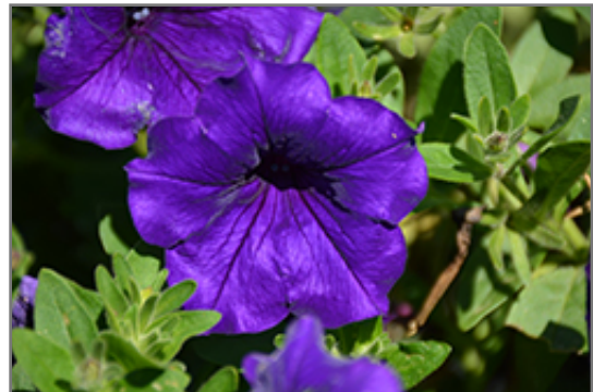
Easy Wave Blue Petunia flowers