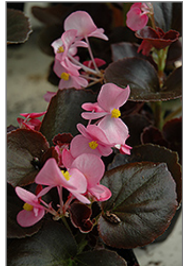
Cocktail Gin Begonia flowers