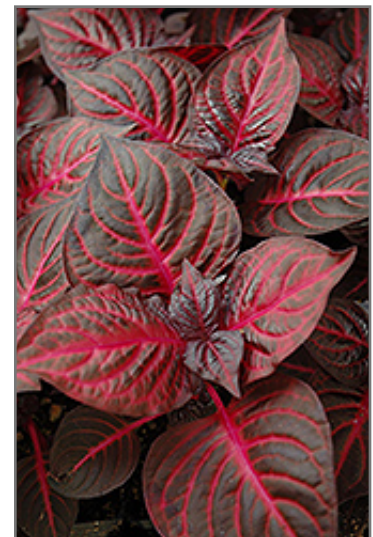
Blazin' Rose Blood Leaf foliage