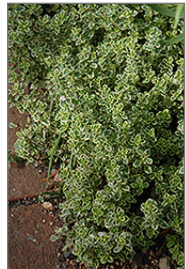
Aureus Lemon Thyme foliage