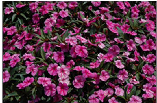
Bounce Pink Flame Impatiens flowers

Bounce Pink Flame Impatiens is recommended for the following landscape applications;