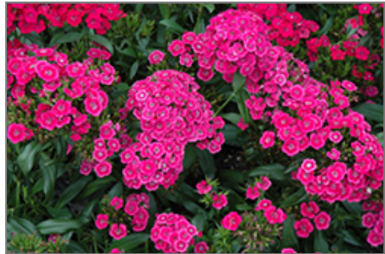
Jolt Pink Hybrid Pinks flowers

Jolt Pink Hybrid Pinks is an herbaceous annual with a mounded form. It brings an extremely fine and delicate texture to the garden composition and should be used to full effect.