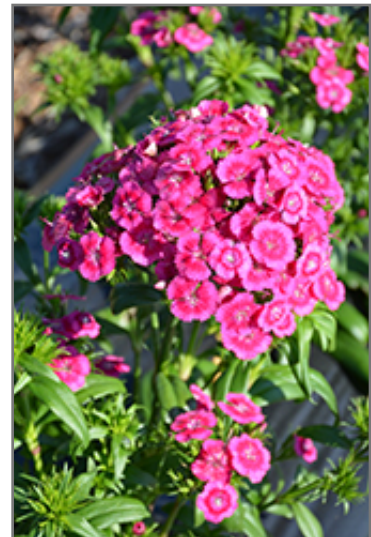
Jolt Pink Hybrid Pinks flowers