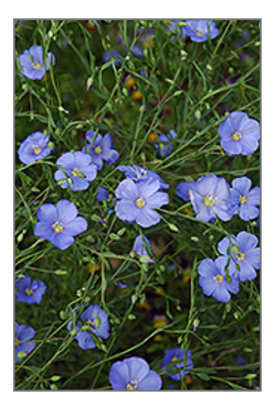
Perennial Flax flowers