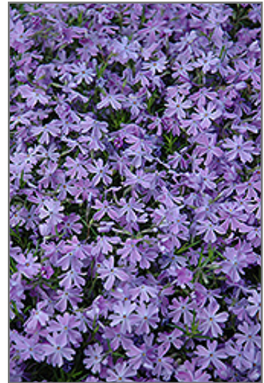
Emerald Blue Moss Phlox flowers

Emerald Blue Moss Phlox is recommended for the following landscape applications;