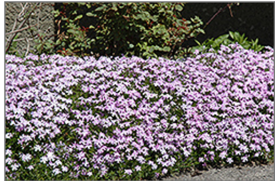
Emerald Blue Moss Phlox in bloom

Emerald Blue Moss Phlox will grow to be only 4 inches tall at maturity, with a spread of 18 inches. When grown in masses or used as a bedding plant, individual plants should be spaced approximately 15 inches apart. Its foliage tends to remain low and dense right to the ground. It grows at a medium rate, and under ideal conditions can be expected to live for approximately 10 years. As an evergreen perennial, this plant will typically keep its form and foliage year-round.