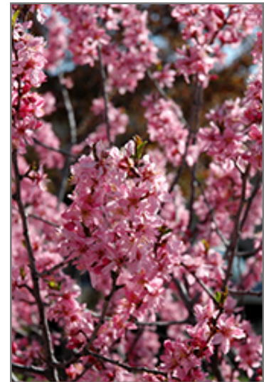
Muckle Plum (tree form) flowers