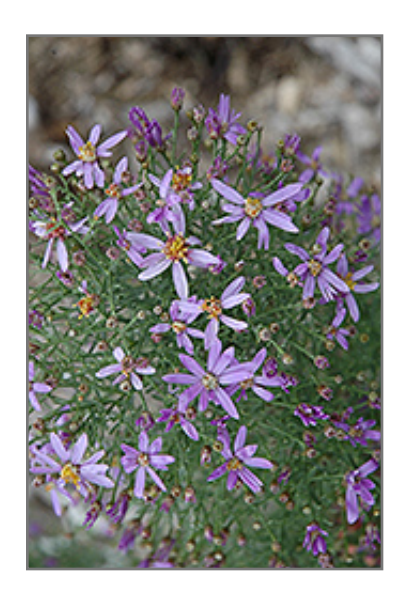
Dwarf Rhone Aster flowers