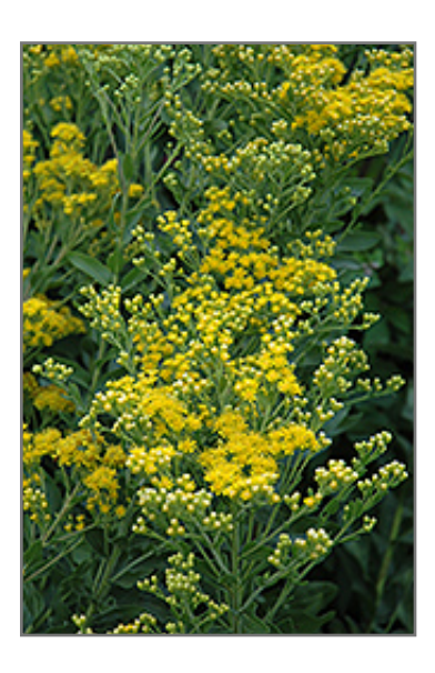
Stiff Goldenrod flowers