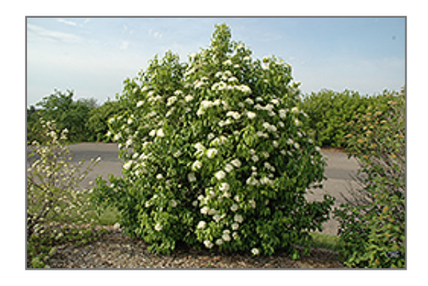
Nannyberry in bloom

Nannyberry is a multi-stemmed deciduous shrub with an upright spreading habit of growth. Its average texture blends into the landscape, but can be balanced by one or two finer or coarser trees or shrubs for an effective composition.