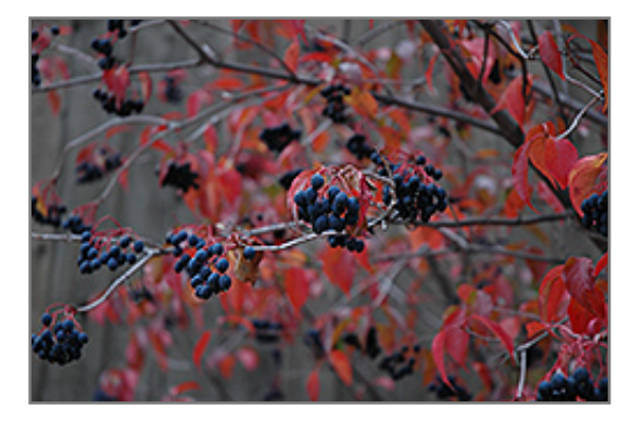
Nannyberry fruit

Nannyberry will grow to be about 15 feet tall at maturity, with a spread of 10 feet. It tends to be a little leggy, with a typical clearance of 4 feet from the ground, and is suitable for planting under power lines. It grows at a medium rate, and under ideal conditions can be expected to live for 40 years or more.