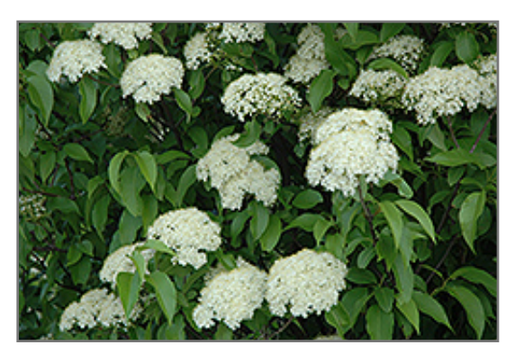
Nannyberry flowers