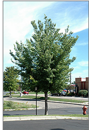
Common Hackberry