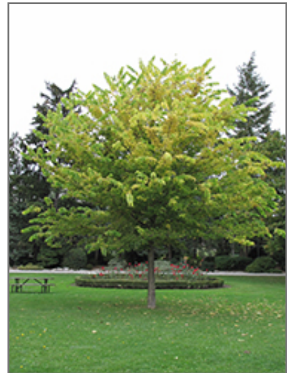
Common Hackberry in fall